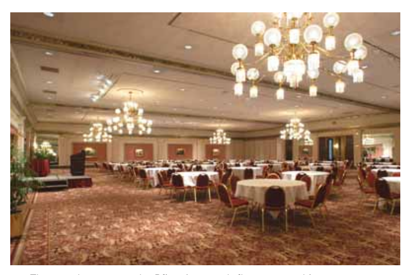
The sound system on the Pfister's seventh floor can combine or separate two ballrooms and additional meeting spaces into as many as 13 individual rooms.

Using this system, Lewis Sound & Video was able to combine a variety of configurations using the two Pfister ballrooms, the Hall of Presidents and King's Row, which are large meeting spaces at either end of the hotel's seventh floor. "Each of those spaces consist of four meeting rooms that are combinable with each other and with the ballrooms themselves," Lewis said. The firm also designed graphic control panels for each room that simplify the otherwise complex combining system.